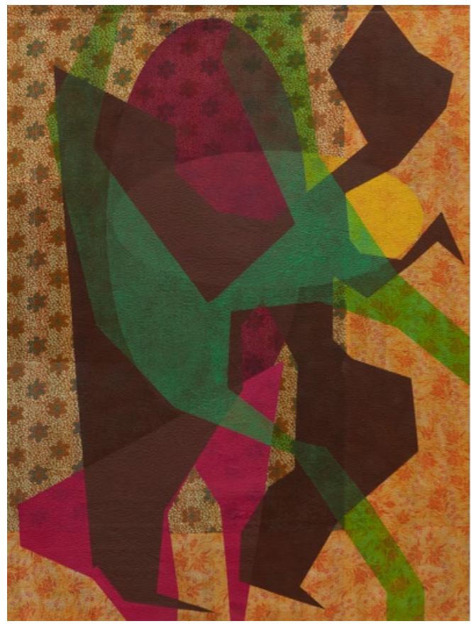
Shezad Dawood Mutant Dancer, 2023 Acrylic on vintage textile hanging

The notion of a mutant is interesting in that it represents a hybrid of two forms. It is a transitional being that is recognizably human but is in the process of evolving in shape and awareness to adapt to the rapidly changing environment. Similarly, the textiles Dawood used were originally created for one purpose, but over time, they evolved to encompass new layers and meanings that have been adapted for their new contexts. Here, textile and paint combine to create this captivating image reminiscent of plant-like forms in movement. Many of the textiles hint at the