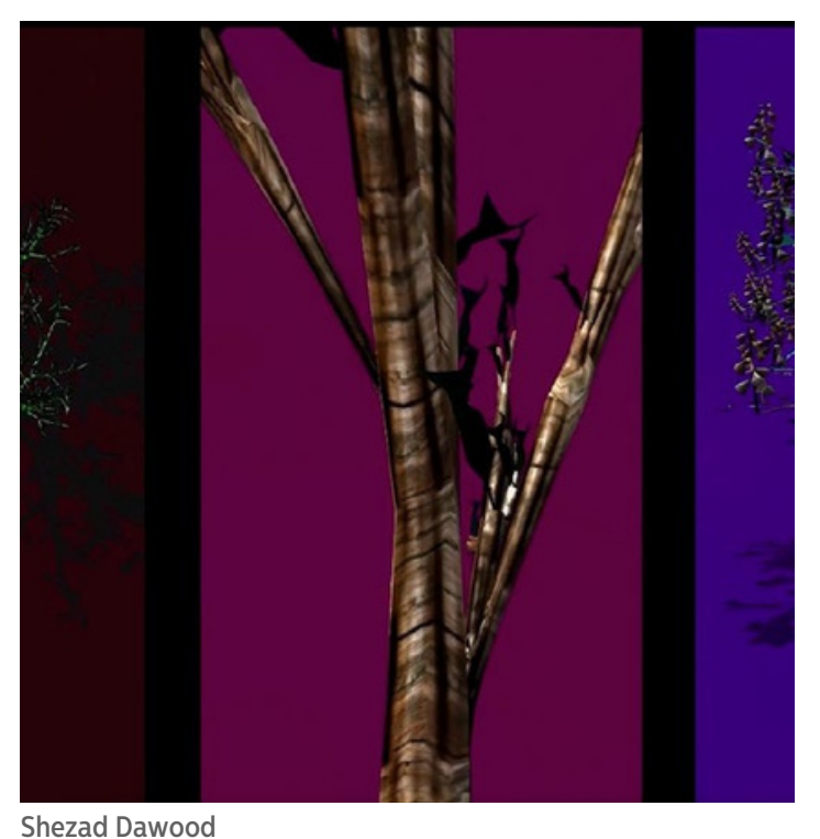
Night in the Garden of Love (Digital Seedbanks), 2023 Seven algorithmically generated plants responding to a new musical score 116 min.

In the case of the Digital Seedbanks, we are experiencing sound in a visual way. The two artforms overlap and create a connected sonic and visual experience. In this context, one is incomplete without the other."