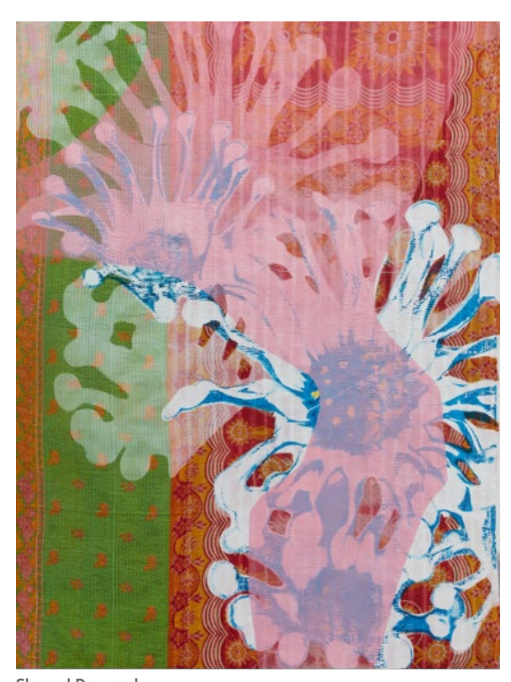
Shezad Dawood Osteospermum, 2023 Acrylic on vintage textile hanging

"Osteospermum presents viewers with a more recognizable and less abstracted image. This daisy from South Africa represents the global breadth of Dawood's interest. Time and space are collapsed in these works in which textiles from the 1970's which were woven in Pakistan, collide with a distinct South African flower which was painted onto these textiles in Dawood's London studio. All these elements coexist within the context of an exhibition that is exploring future realities. In this piece, we find an example of how Dawood's cross-cultural and trans-historical vision operates outside of Western-centric traditions. These strange and unexpected connections remind us of how interconnected we are."